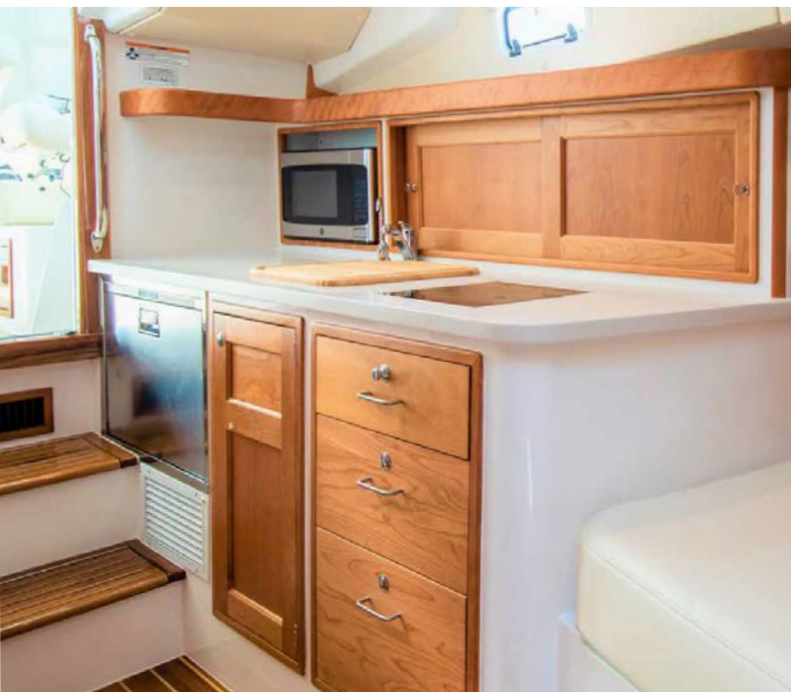
Beautiful above and below cabinet storage

Classic destroyer wheel and a modern helm layout accented by a solid teak companionway hatch. A full galley with plenty of counter space, refrigerator, and cooktop.