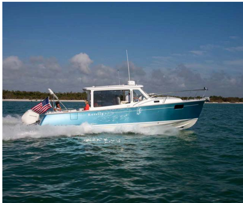
Comfortable ride at a top speed of 50 MPH