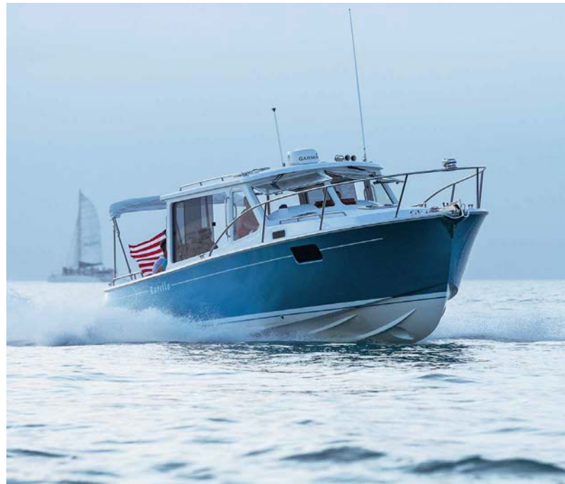
Fast, fun, and best in class sports car handling