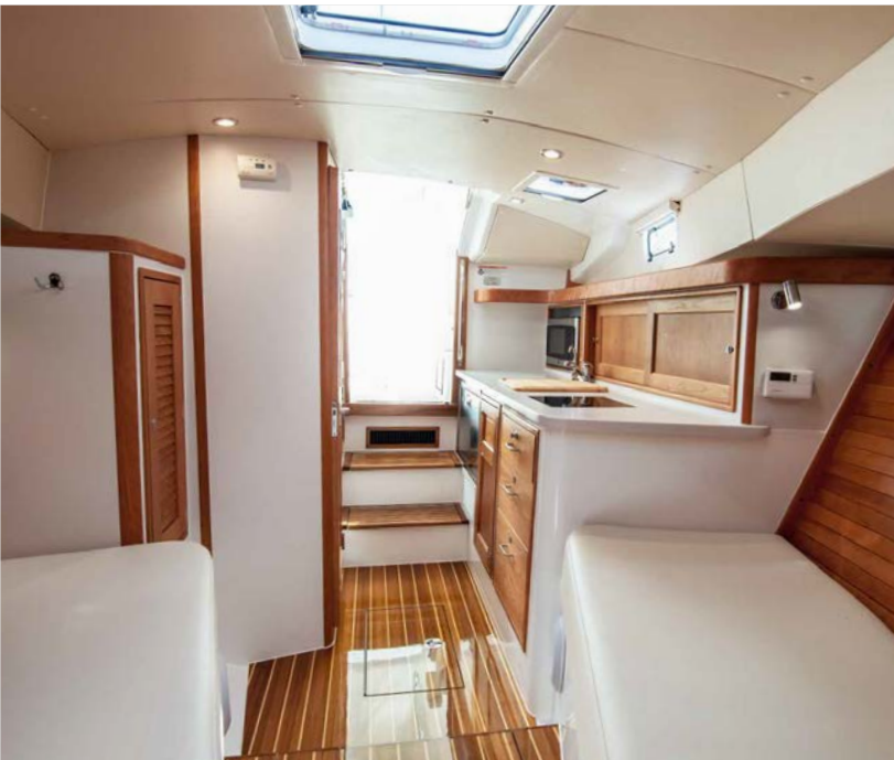
Corian solid surfaces throughout

High-performance luxury outboard day-yacht, ideal for a day on the water with friends and family, entertaining, and weekend cruising. Amazing shoal draft capabilities and the best family dayboat under 40-feet. Drive a 35 and get to know the responsive power and stability of her hull and the open layout that brings the party together.